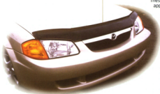
1998-2000 Mazda Protege

Benevento hood guards are CAD-CAM designed to insure a proper fit every time. Each hood guard is thoroughly inspected, carefully packaged, and comes with everything you need for a quick no-drill installation