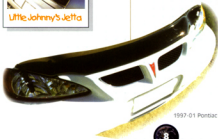
1997-01 Pontiac Grand Prix