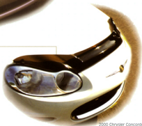
2000 Chrysler Concorde