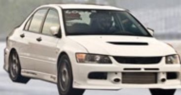
Awd Motorsports World's Quickest Evo Street Car 8.98@156mph