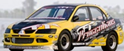
Kings Performance Mitsubishi EVO 8.87 @ 160 Mph