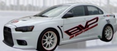
Big Valley Performance