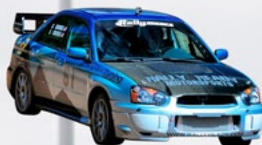
Rally Ready Motorsports Pikes Peak Rally Subaru