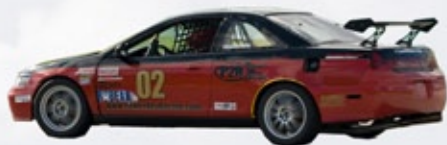
P2R Power Rev Racing FARA MP2-B Honda Accord