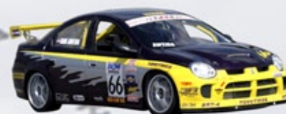
3R Automotive World Challenge Neon Srt-4