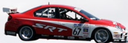
3R Automotive World Challenge Neon Srt-4