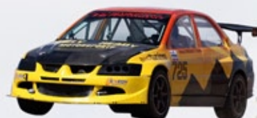
Rally Ready Motorsports Pikes Peak Mitsubishi EVO 08,09,10 Open class Winner