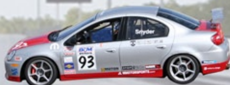
Snyder Motorsports World Challenge Neon Srt-4