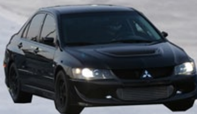
Awd Motorsports Mitsubishi Evo 8.75 @163Mph