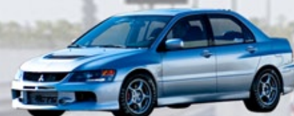
Modern Automotive Performance Mitsubishi EVO