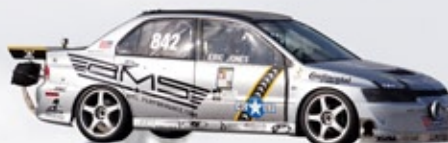
AMS Performance Worlds Fastest Standing Mile Mitsubishi EVO 228 Mph