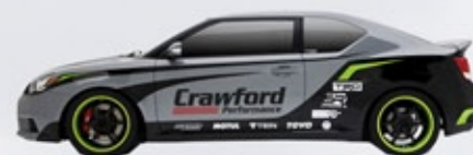
Crawford Performance 2011 Scion TC