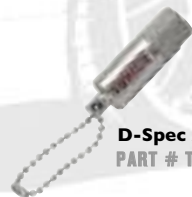
D-Spec Adjuster PART # TO 00101