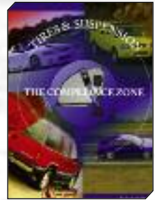
Tire & Suspension Guide TO10400