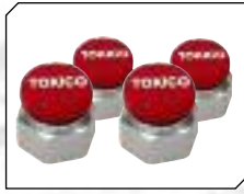
TOKICO D-Dpec HTS Dust Caps, Set of 4 TO00105