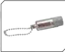
HTS/D-Spec Adjuster Key Chain, Ea. TO00101