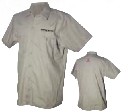
TOKICO Dickies Shirt TO10704-S, M, L or XL