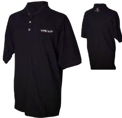
TOKICO Polo Shirt TO10703-S, M, L or XL