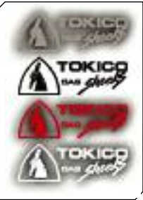
Small Decal (1.5"x5") Die Cut Silver TO10602 Black TO10603 Red TO10604 White TO10605