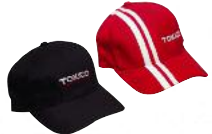
TOKICO Flex Fit Caps T010705 TOKICO Black Cap - One size fits all. T010706 TOKICO Cap Du Jour - Style / Design Color may change. Call for details. One size fits all.