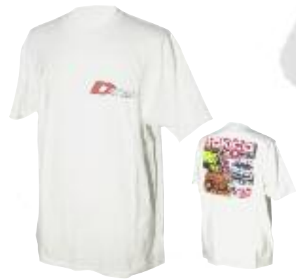
TOKICO T-Shirt Du Jour TO10700-S, M, L or XL