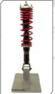
Shock Display Stand TO10404