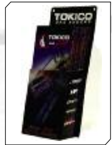
POP Counter Top Stand TO10403 POP Mini Brochure Pack of 50 TO10402