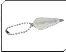
Illumina Adjuster Key Chain, Flat, Ea. TO00102