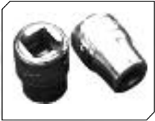
Shock Absorber Sockets TO00103 Socket, 5/16 Stem Oval, 3/8" Drive, Ea. TO00104 Socket, 21/64 Stem Oval, 3/8" Drive, Ea.